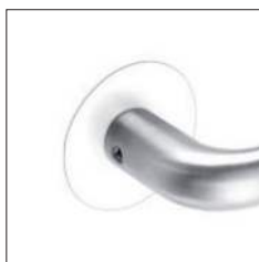
RAL-colour on request