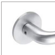
Reduced height of rosettes 4mm