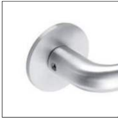
Reduced height of rosettes 4mm